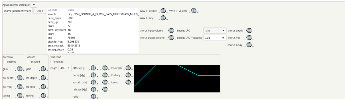
The SFZ synth screenshot